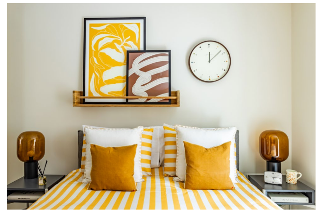
KING-SIZED BED & BED SIDE TABLE

Our interior designers have curated a premium-quality furniture package including bespoke pieces all set up and ready for when you move in. Prefer to BYO? Nae bother. Speak to a member of our team to see if we have any unfurnished options still available.