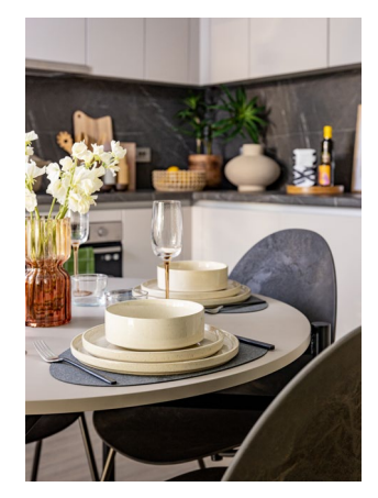
DINING TABLE & CHAIRS