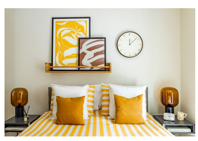
DOUBLE BED & BED SIDE TABLE