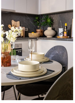
DINING TABLE & CHAIRS